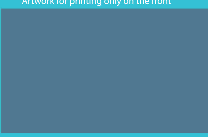
Foil black only (foil area as 100% black)